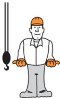
Extend Telescoping Boom