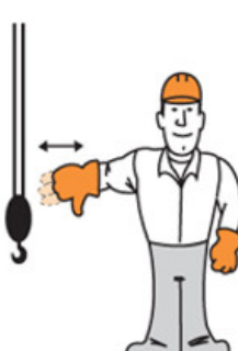
Lower the Boom Raise the Load