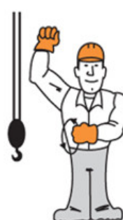
Crawler Crane Travel One Track