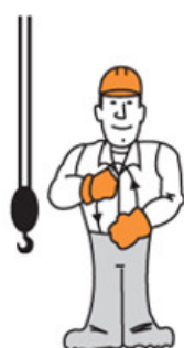
Crawler Crane Travel Both Tracks