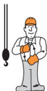
Crawler Crane Travel Both Tracks