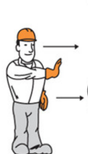
Travel/ Tower Travel