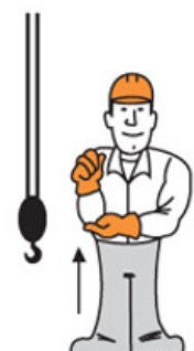
Use Auxiliary Hoist