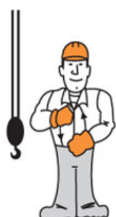
Crawler Crane Travel Both Tracks