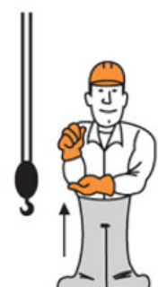
Use Auxiliary Hoist