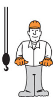
Retract Telescoping Boom