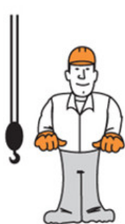
Retract Telescoping Boom