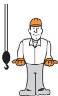
Extend Telescoping Boom