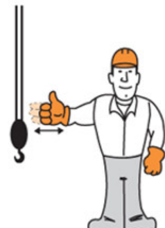
Raise the Boom Lower the Load