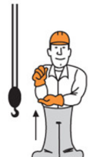
Use Auxiliary Hoist