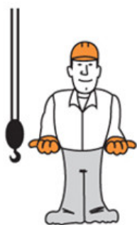
Extend Telescoping Boom