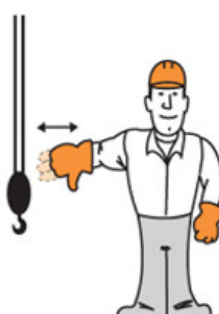
Lower the Boom Raise the Load