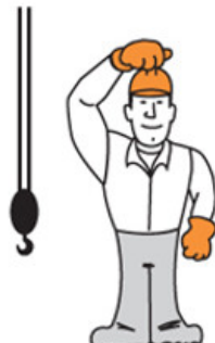
Use Main Hoist