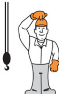
Use Main Hoist